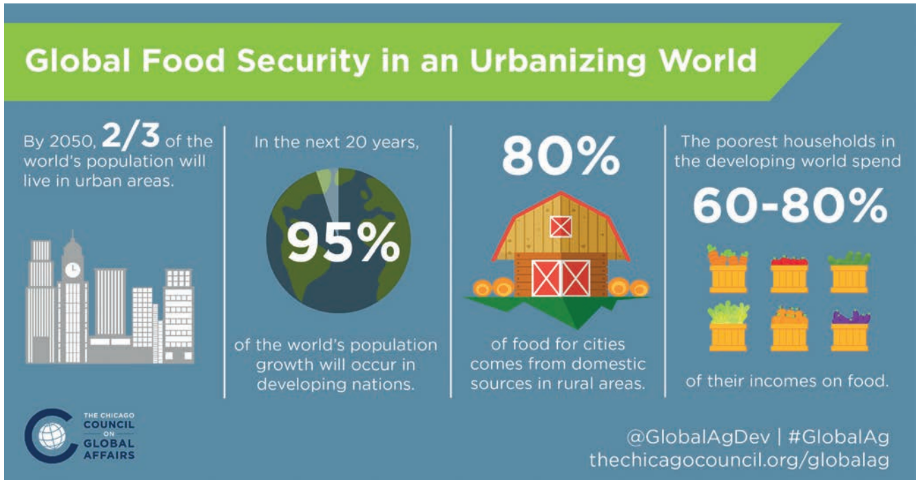
Fig. 9 – Infographic about Global Food Security